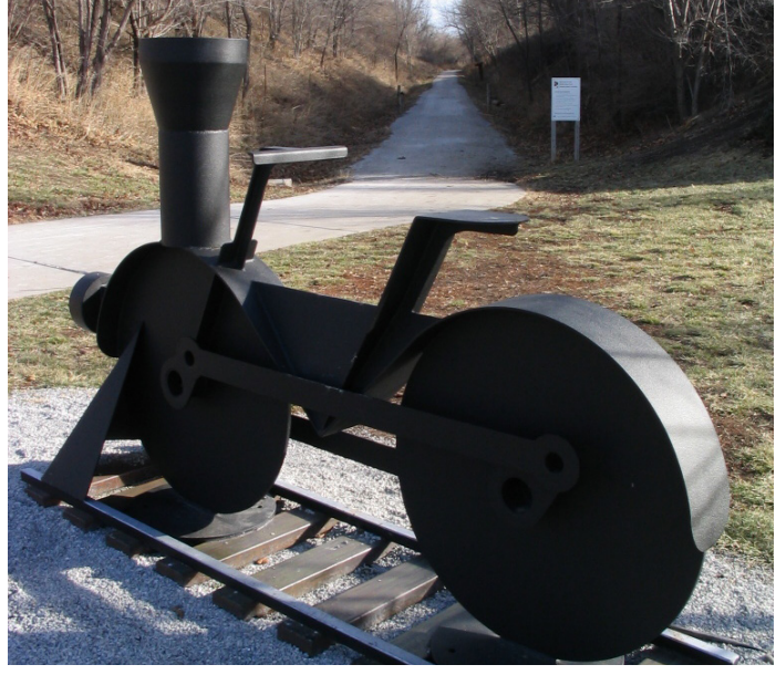
Bicycle Art on the MoPac Trail in Nebraska Alta Planning + Design

Natural territorial reinforcement occurs by using buildings, fences, pavement, signs, lighting and landscape to express ownership and define public, semi-public and private space. Additionally, these