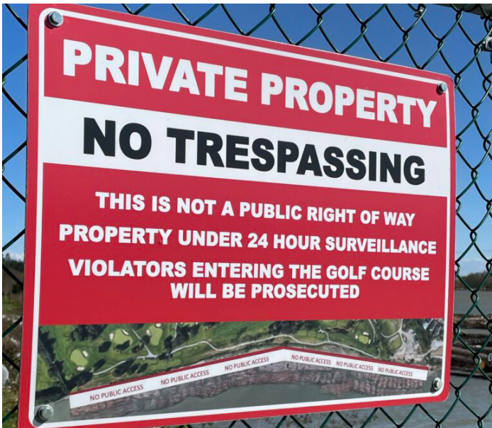
No Trespassing signage Viewpoint Vancouver