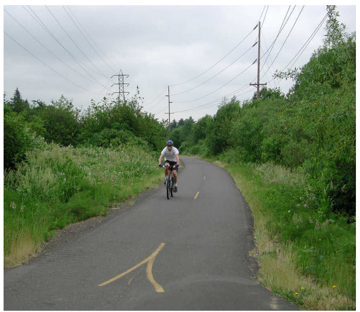
Vegetation buffer along a paved trail Alta Planning + Design

Limited information from existing case studies indicates that safety, security, and liability have not been major problems on existing trails. If properly designed and managed, a trail would have roughly the same safety conditions as a home or public road located next to a golf course—both common conditions. The following sections outline how a trail can maximize safety and security along golf courses while minimizing liability.