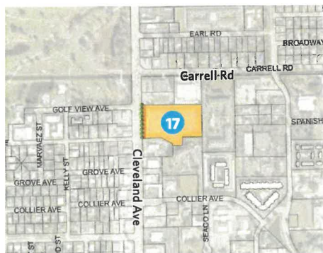
Fig 6. Off-Site Housing Site on Cleveland Avenue